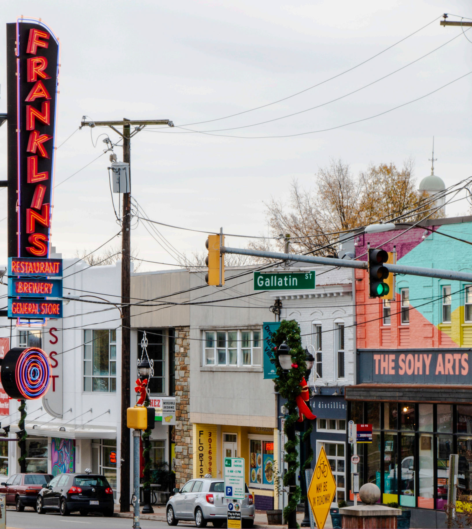
The Gateway Arts & Entertainment District is an active business development corridor located in Prince George's County. Spanning two miles along Route 1 Baltimore/Rhode Island Avenue, the District is home to a variety of restaurants, coffee houses, local and regional theatres, galleries, and Gateway businesses supporting the economic vitality of the local art community.