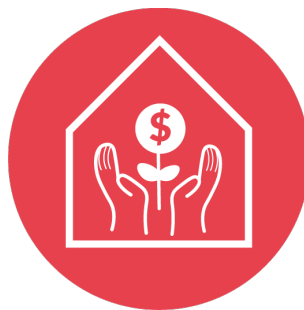
COMMUNITY WEALTH BUILDING