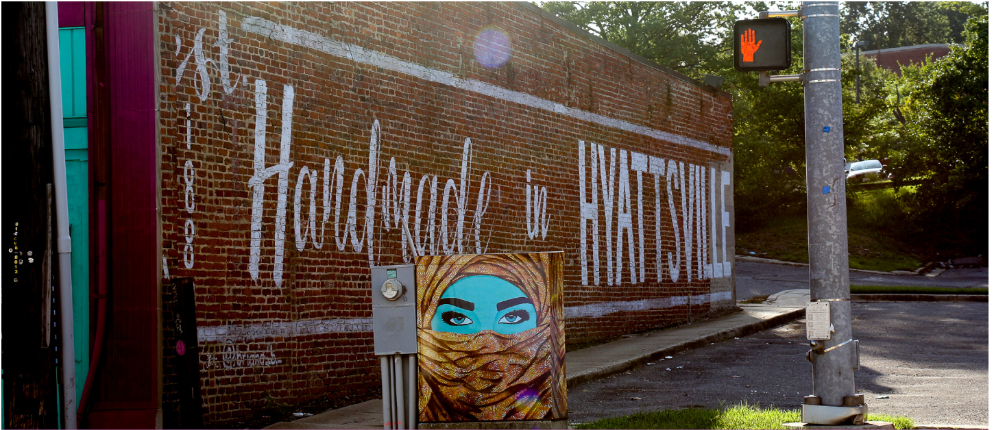
Hyattsville, located in Prince George's County directly adjacent to the District of Columbia, is home to a thriving arts district, supporting a number of small businesses and local creative jobs.