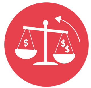
EQUITABLE ECONOMIC DEVELOPMENT