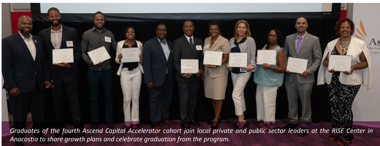
Graduates of the fourth Ascend Capital Accelerator cohort join local private and public sector leaders at the RISE Center in Anacostia to share growth plans and celebrate graduation from the program.

In 2019, Wacif celebrated the graduation of the third and fourth cohorts of its award-winning Ascend Capital Accelerator program. Both cohorts focused on entrepreneurs of color, and the entrepreneurs collectively represented 18 companies across the Washington, D.C. region. Among the 21 Ascend graduates, 100% identified as people of color and 57% identified as women.